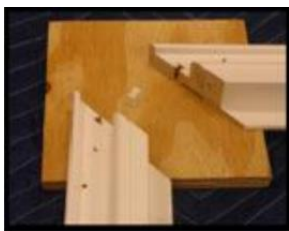
Set Hoffman Key round side up and push top frame down onto the Hoffman Key.