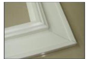
Position the left frame on the Hoffman Key and push down until the frames mitered edges are flush.